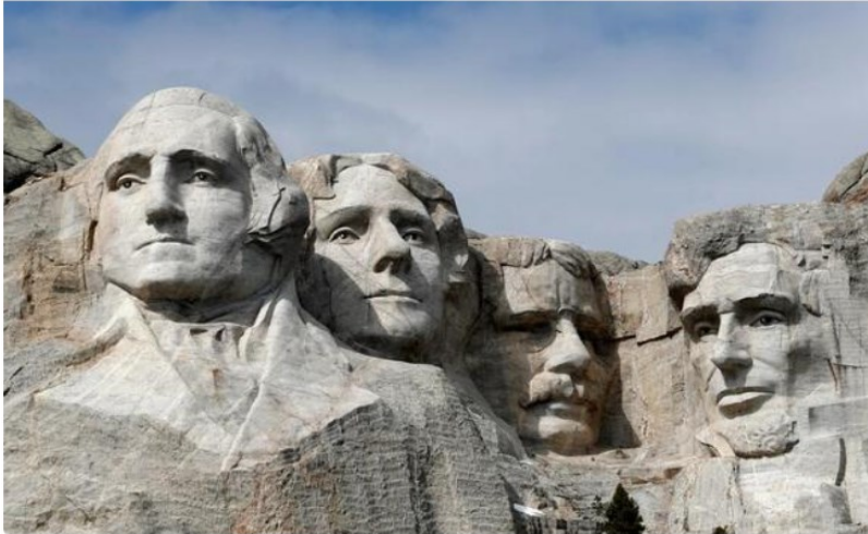
Bearing the likeness of four United States chief executives, Mount Rushmore is pictured in 2019 in Keystone, South Dakota.