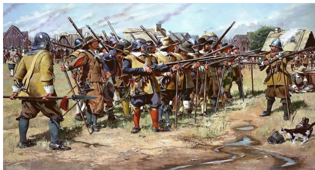
Spring of 1637 First Muster of the Massachusetts Bay Colony Militia