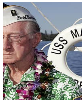
1991 Pearl Harbor 50th Anniversary Commemorated