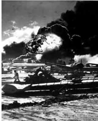
1941 Japanese attack Pearl Harbor, Hawaii