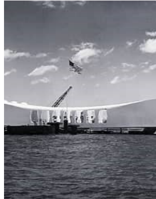
1962 USS Arizona Memorial dedicated by President Kennedy